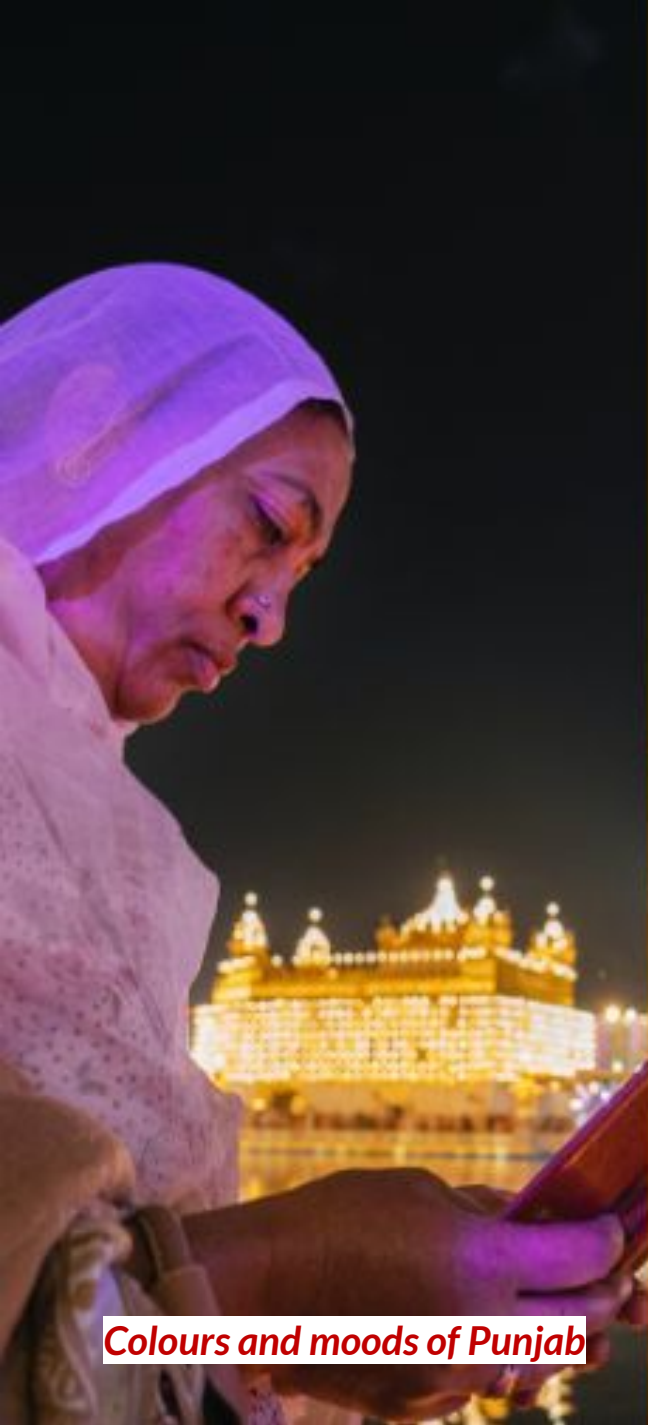
Colours and moods of Punjab