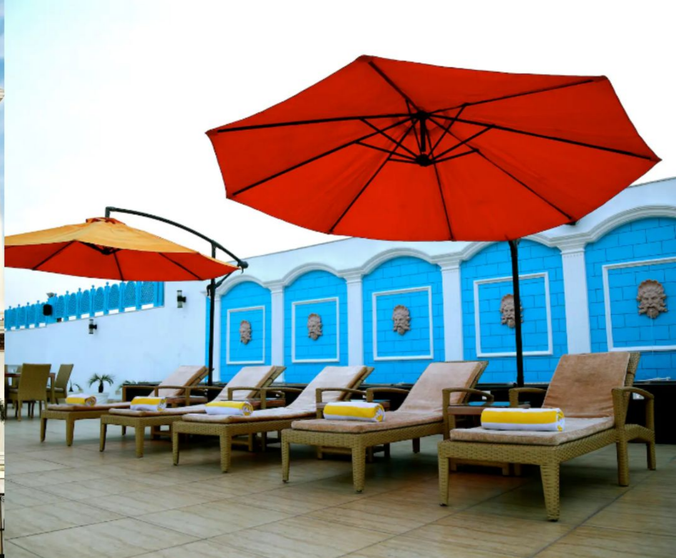
Venue: Ramada by Wyndham